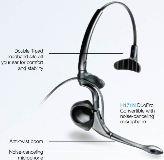
H171N DuoPro Convertible with noise-canceling microphone